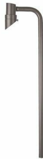
PL1 MANUF. LIGHTOLOGY CODE: WAC558080