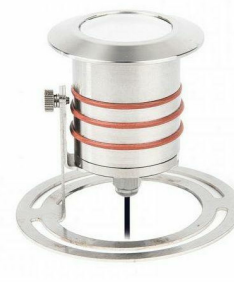
P1- WATER RESISTENT POOL LIGHTING