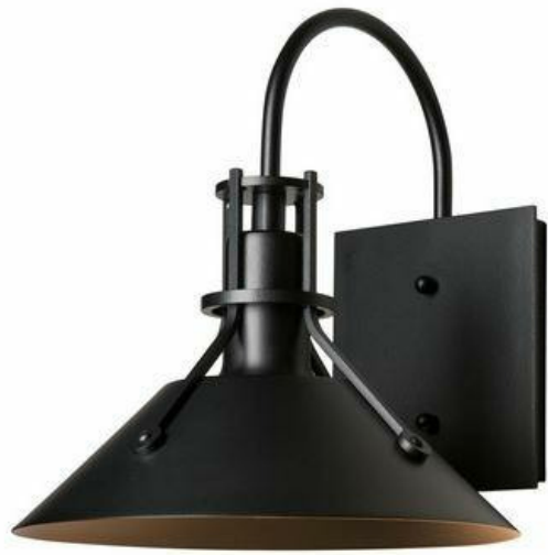
WS1 MANUF. LIGHTOLOGY CODE: HUB857419