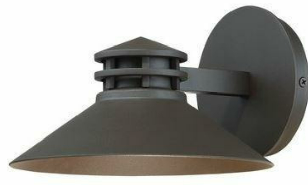
WS2 MANUF. LIGHTOLOGY CODE: WAC532608