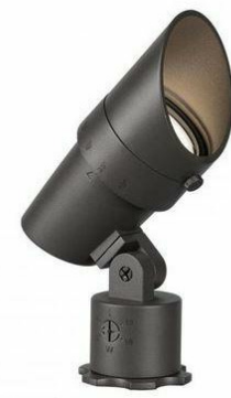
AL1 MANUF. LIGHTOLOGY CODE: WAC449098