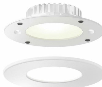
R1- WATER RESISTENT (UNDER DECK) MANUF. LIGHTOLOGY CODE: DLS891485