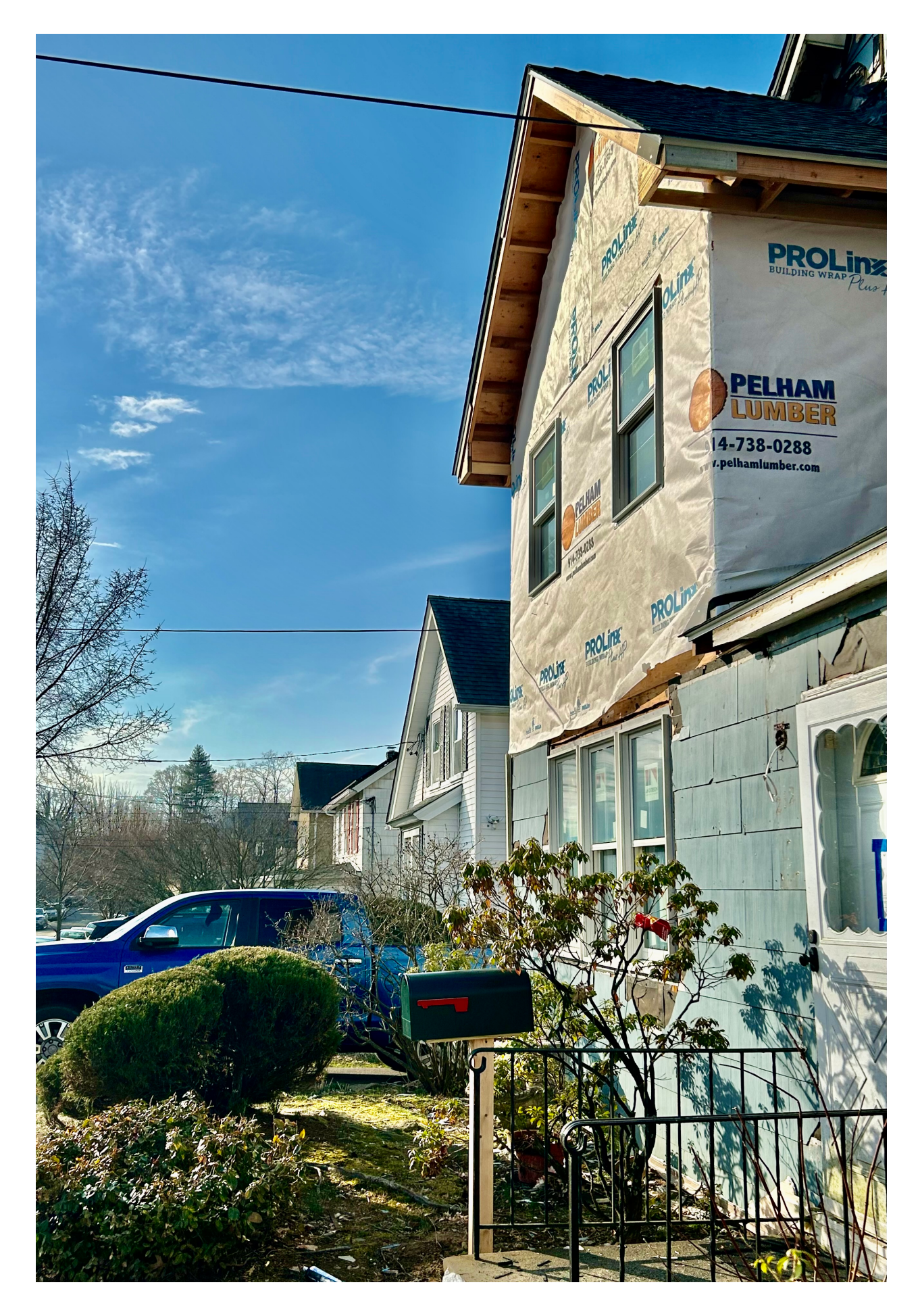
From Premises Looking South