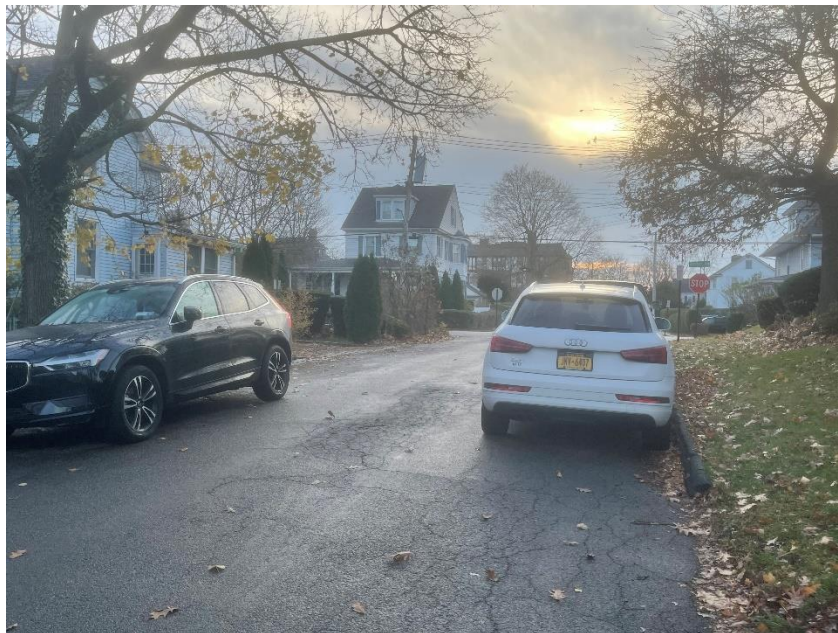
Heathcote Avenue looking south (adjacent to 505 Prospect Avenue)

For your review, I am including a copy of an e-mail Mr. Barney sent to me following our meeting. The roadway is approximately 24’ feet wide, and assuming vehicles are parked on both sides, it leaves an approximate 8’ travel lane which cannot support two lane traffic, let alone not being wide enough to support heavy vehicles such as sanitation vehicles or large dump trucks. Mr. Barney reported that when vehicles are parked on both sides, sanitation trucks have to drive in reverse from the Stanley Avenue side of Heathcote Avenue to access the roadway. See below picture.