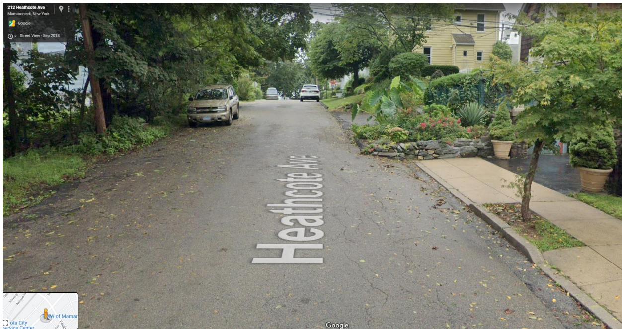
Heathcote Avenue looking south (adjacent to 212 Prospect Avenue)

Based on the field inspection, staff recommends that the existing “no parking” restriction be extended from the current 20’ on the west side of the road of north of Prospect Avenue to 150’ north of Prospect Avenue. As demonstrated by the photo below, the paved roadway is wider in front of 212 Heathcote Road and is constricted in front of 505 Prospect Avenue.