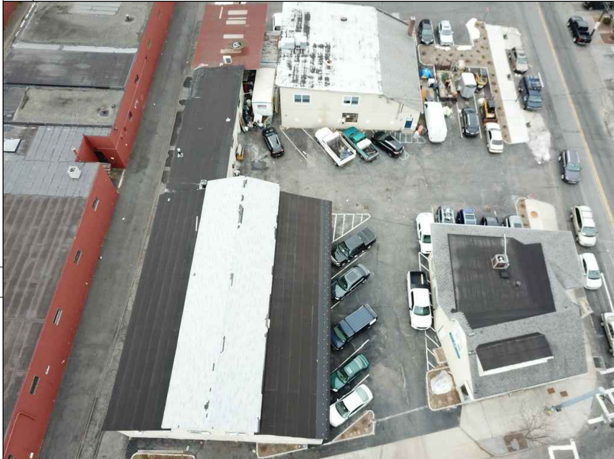
2 AERIAL PHOTO, FACING SOUTHWEST