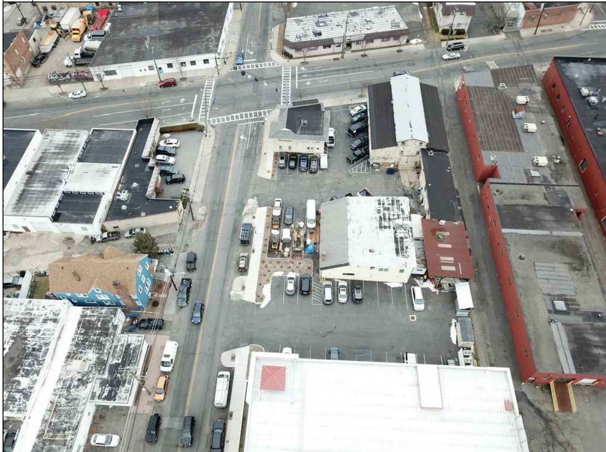
3 AERIAL PHOTO, FACING NORTHEAST (TOWARD FENIMORE RD)

KTM Architect, NCARB Kimberly Tuter Martelli, PLLC 42 North Main Street, 2nd Floor Port Chester, NY 10573 info@ktmarchitect.com (914)481-8877