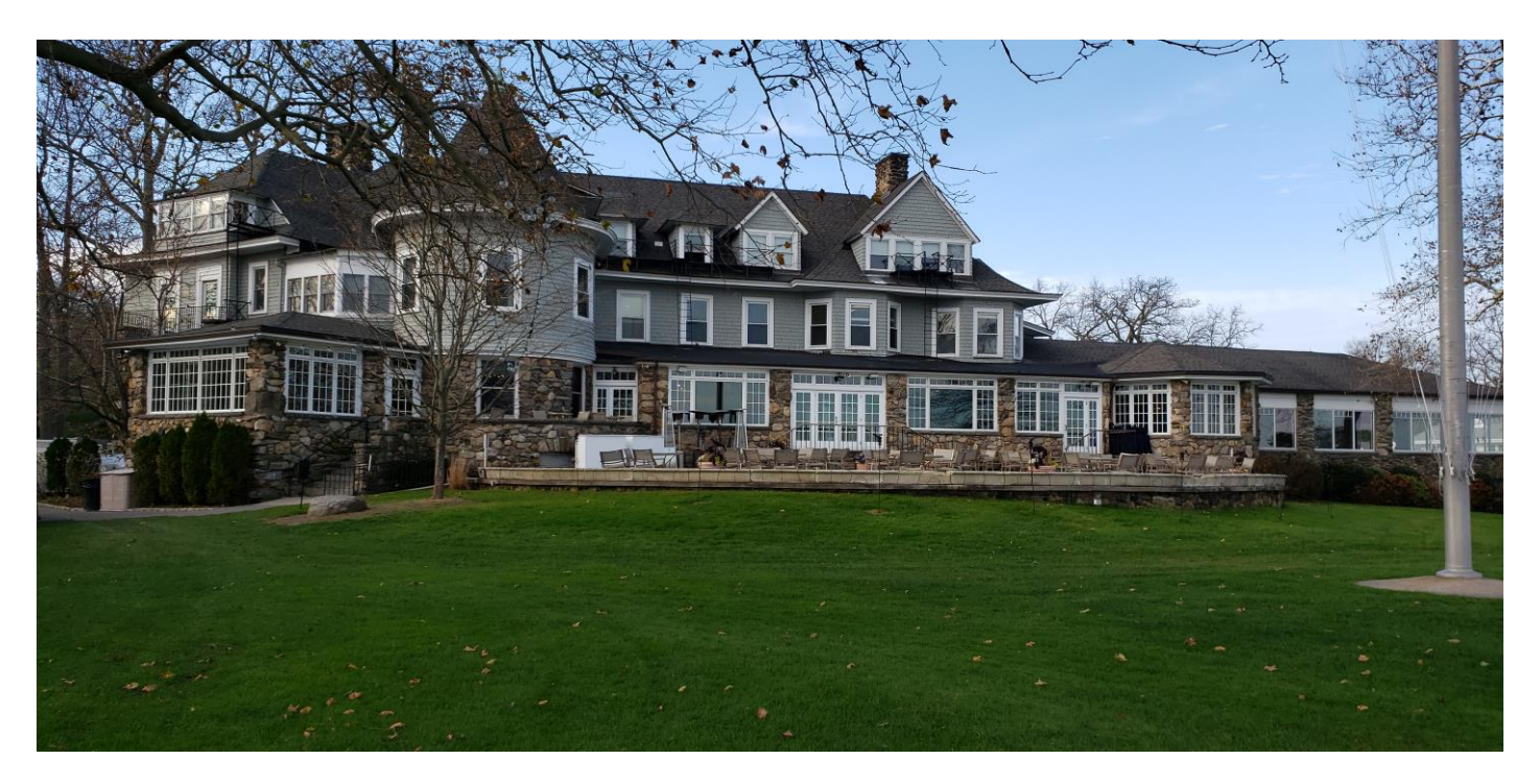
P-7 Rear facade of Main Club House showing existing rear terrace and perimeter concrete planters. (view looking west)