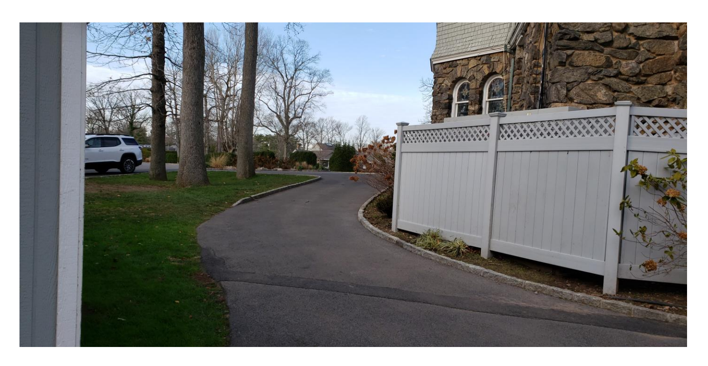
P-5 Asphalt access drive from existing rear terrace behind Main Club House to main driveway. (view looking north)