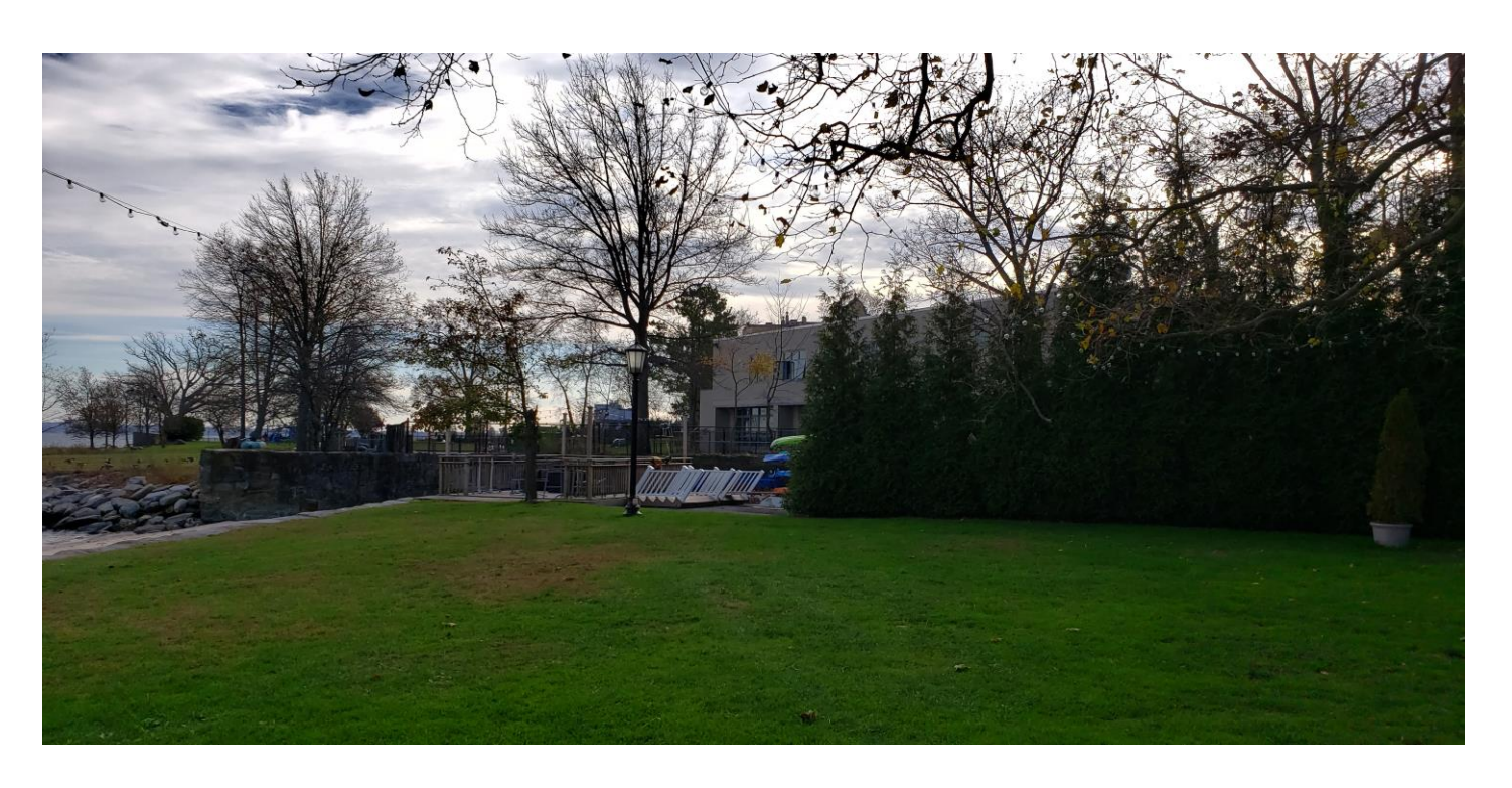
P-9 Westchester Hebrew High & Day School from behind existing rear terrace. (view looking south)