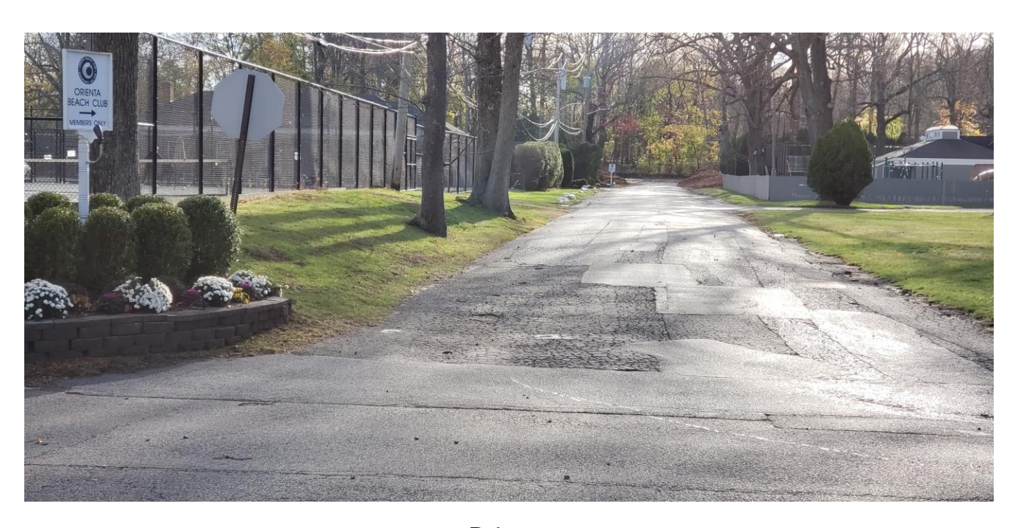
P-1 Intersection of Rushmore Ave. and Bloomdale Ave. to Orienta Beach Club entrance. (view looking southwest)