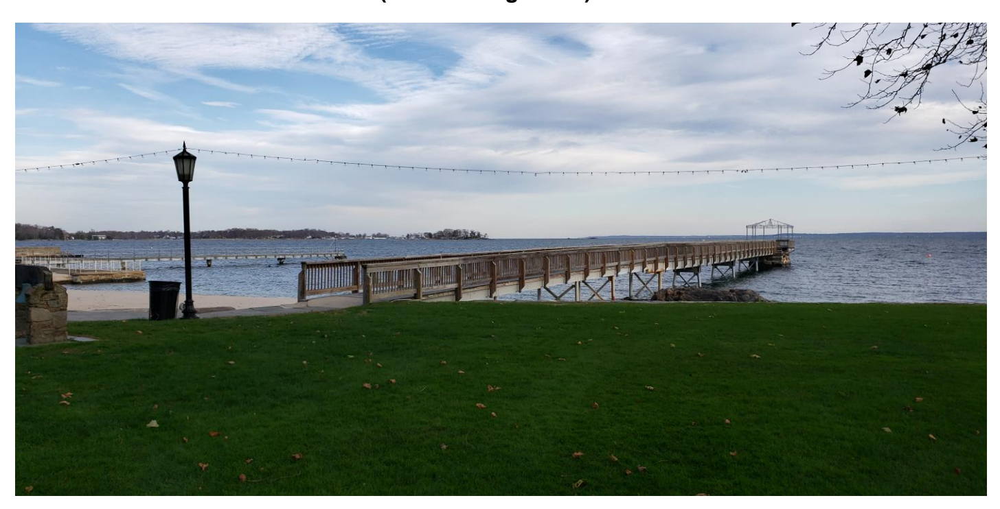
P-10 Existing pier, beach, and stone wall from rear terrace to Long Island Sound. (view looking east)