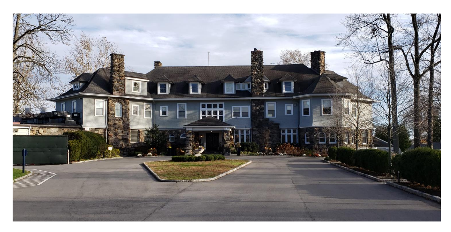
P-4 Orienta Beach Club Front Facade from driveway/parking lot. (view looking southeast)