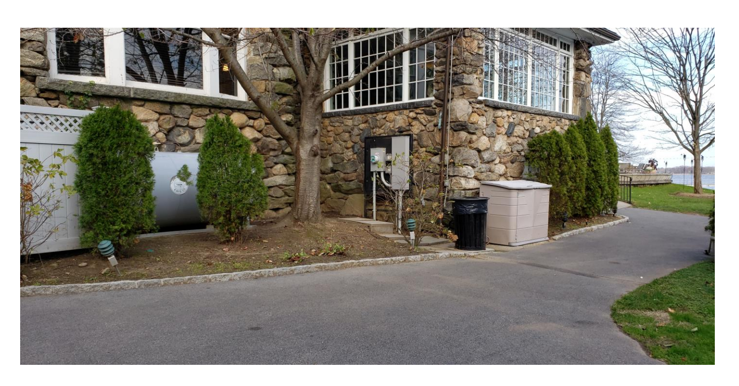
P-6 Asphalt access drive from existing main driveway to existing rear terrace behind Main Club House. (view looking east)