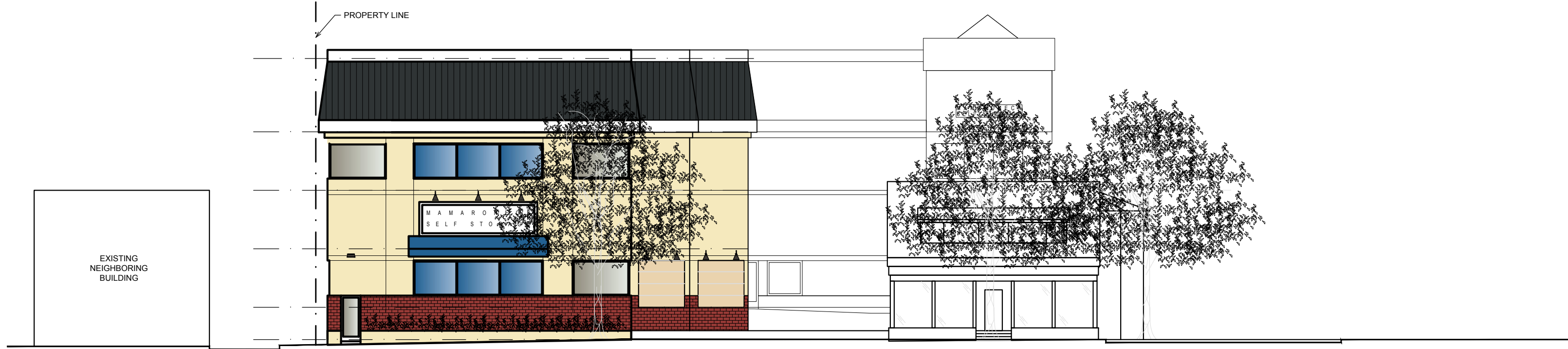
2 FENIMORE ROAD: EXISTING CONDITIONS & PROPOSED IMPROVEMENTS SCALE: 1/16"=1'-0"