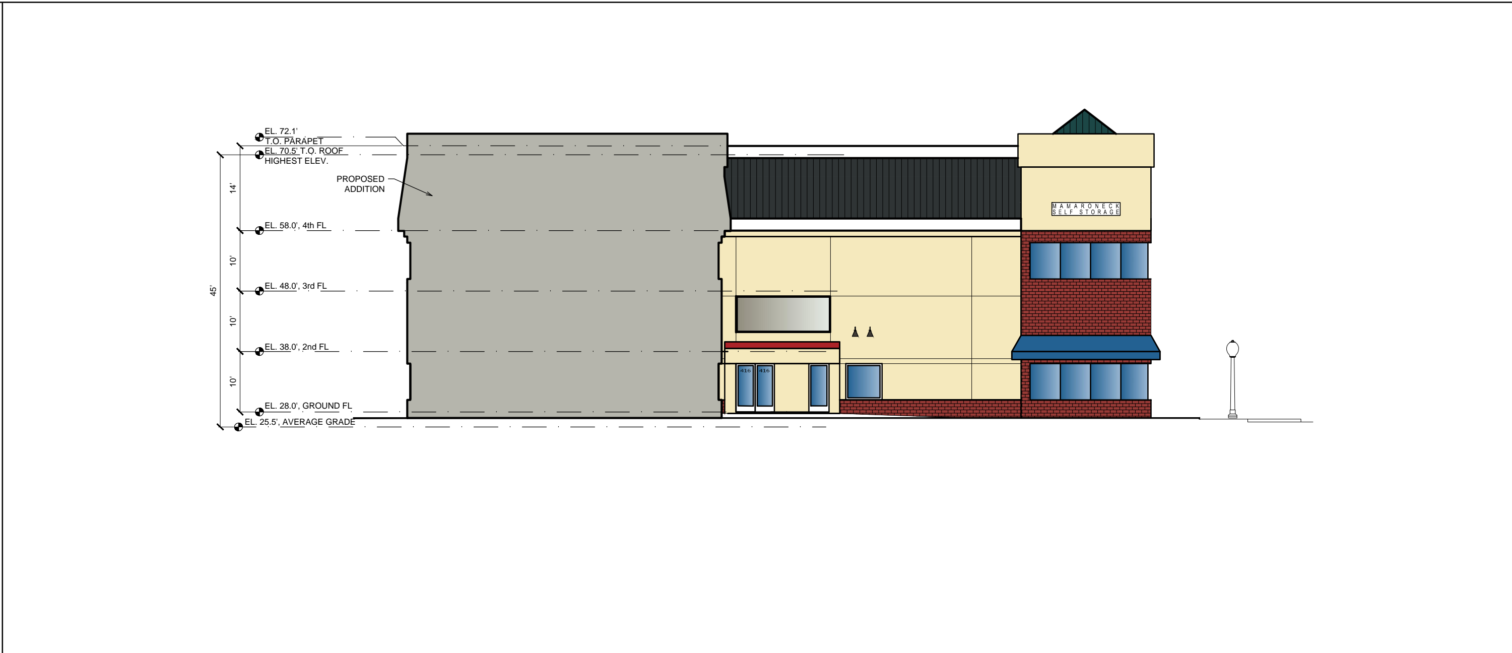
2 ADDITION PROFILE ADJACENT TO EXISTING FACADE SCALE: 1/16"=1'-0"