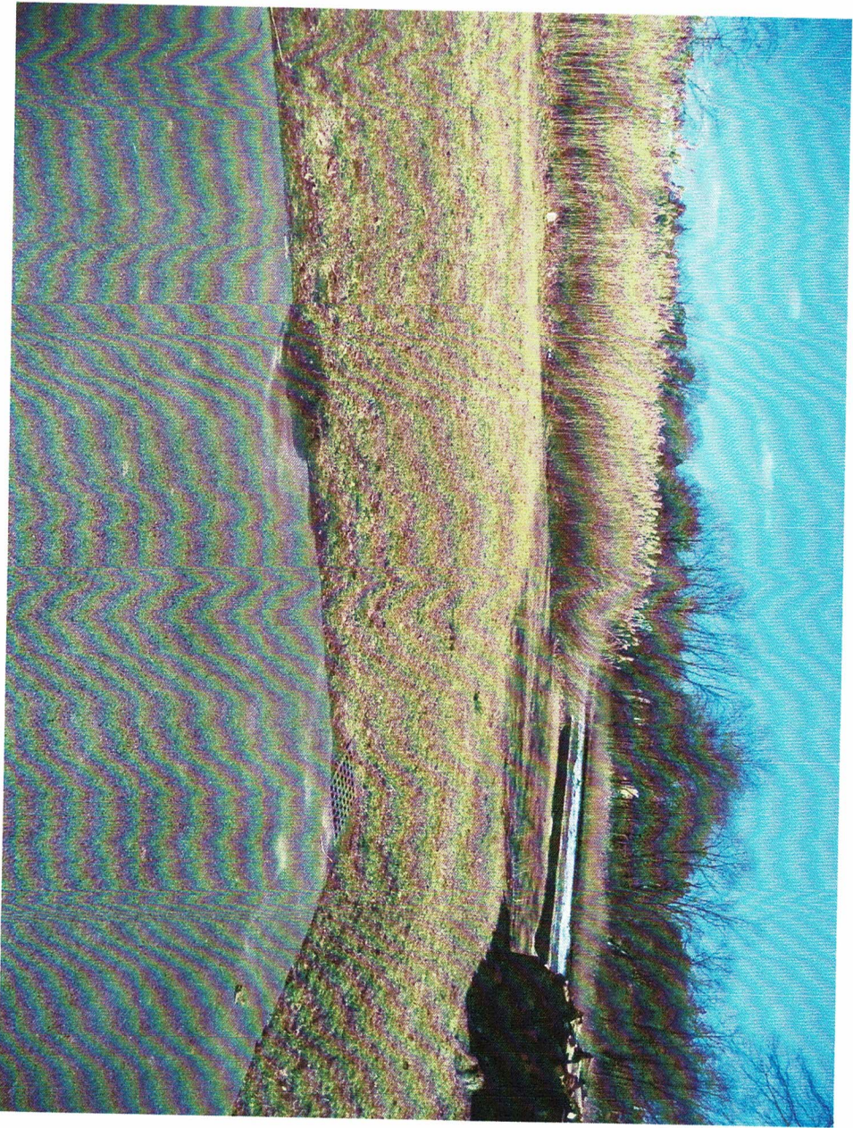
Photo 3. Looking southeast along route of proposed 6" pipe from the driveway for 716 Guion Drive. Existing catch basin to be replaced at the corner of the driveway. (Photo taken 2-26-19)