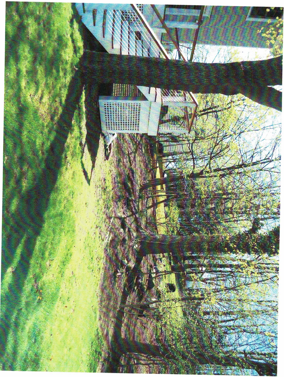
Photo 1. Looking northwest from back of 716 Guion Drive at area to be landscaped. (Photo taken 5-2-18)