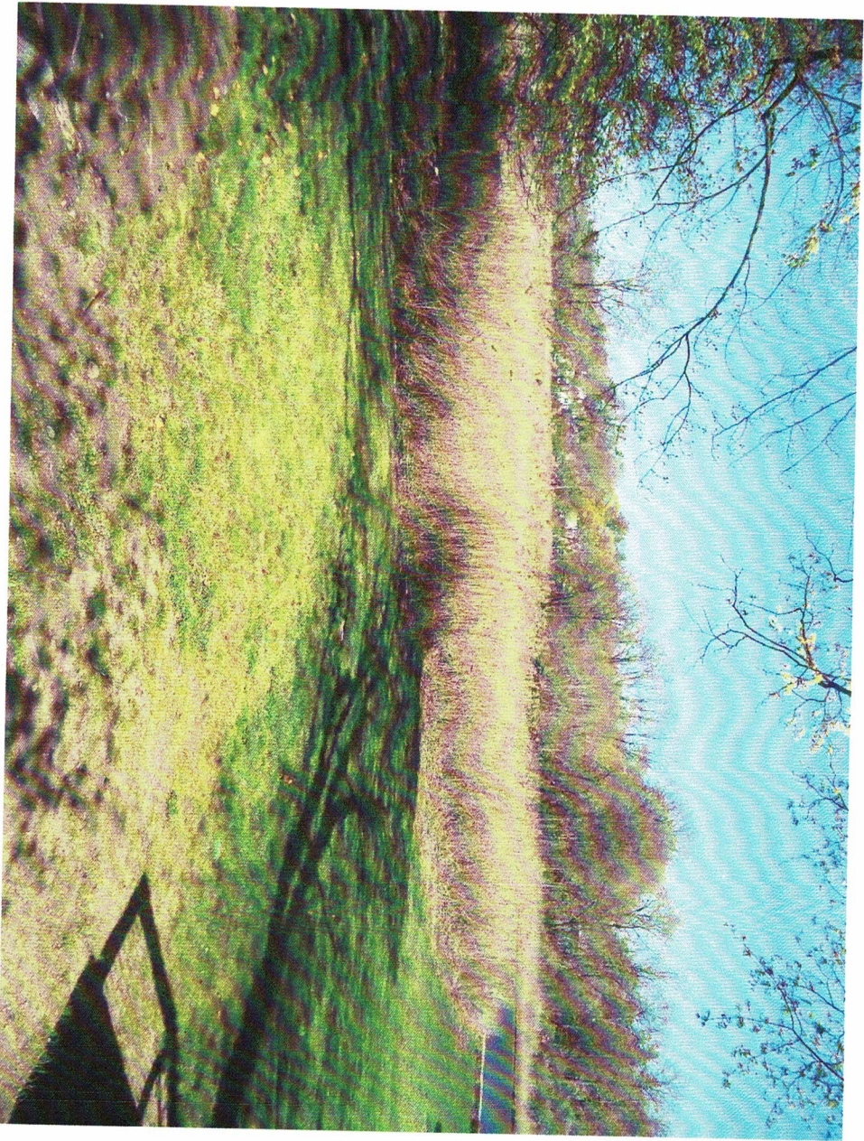
Photo 2. Looking southeast at area of reeds across 721 Stuart Ave and 716 Guion Drive. (Photo taken 5-2-18)